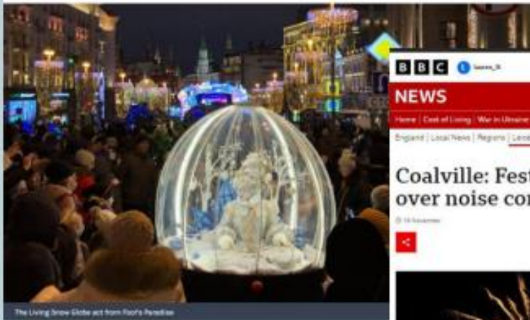
The Living Snow Globe act from Pop's Pavilion

By Coalville Hub News Reporter 10th Nov 2022 | Local News